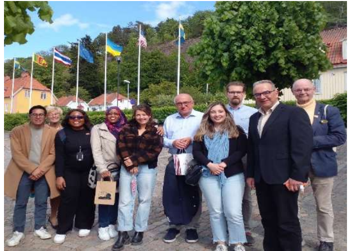
Class XX Fellows with members of the Rotary Clubs in Gränna and Hjo.